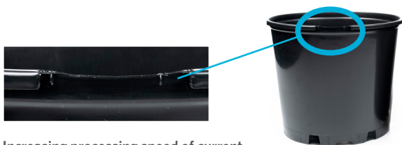
Increasing processing speed of current low melt flow PP resin results in a short shot.

Manufacturer remains firm on the importance of high impact properties in their polypropylene resin and therefore sources a less desired, lower melt flow resin in order to meet physical properties. This in turns limits the overall ability to increase manufacturing speeds.